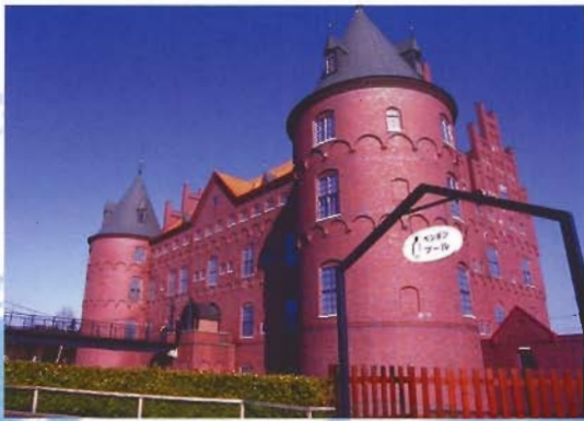
Nixe Castle (summer)

Noboribetsu Marine Park Nixe is a theme park centered on the ocean, which is the origin of life. The beautiful Nixe Castle in the park's center is a four-story aquarium constructed using state-of-the-art scientific technology. The eight-meter-high large wide-angle water tank, the Crystal Tower and the first underwater tunnel in Hokkaido (Aqua Tunnel) will make you feel as if you were walking in the sea. From the escalator connecting the second and fourth floors, you can watch fish leisurely swimming below.